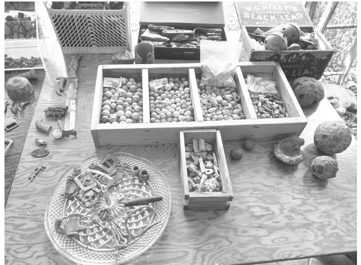
Musket Balls in the center Cannon Balls to their right Horse Bells upper right