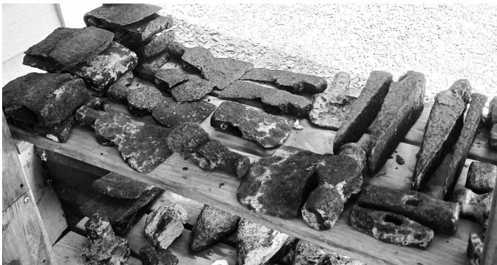
Horseshoes above and Axe heads below