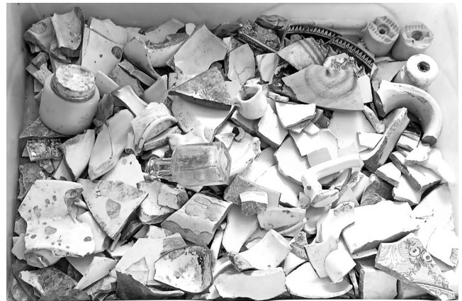
Bits of Broken Pottery

Jim's collection includes bits of harmonicas and juice harps, knives and forks (some forks have tines that look dangerously pointy), spikes and nails, metal parts from harnesses, and metal bag seals from mailbags, for example.